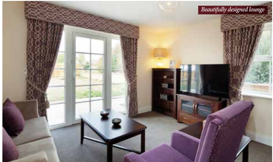
Beautifully designed lounge