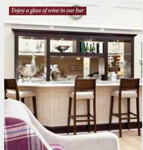
Enjoy a glass of wine in our bar