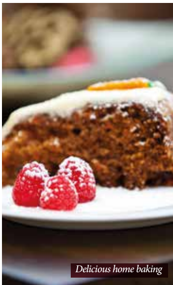
Delicious home baking