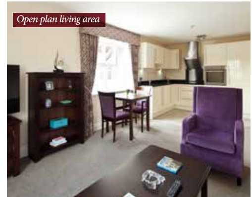
Open plan living area

All residents within our apartments have access to all of the facilities Beaumont Manor has to offer, including a wide range of social events, activities and fine dining in the company of new friends and neighbours.